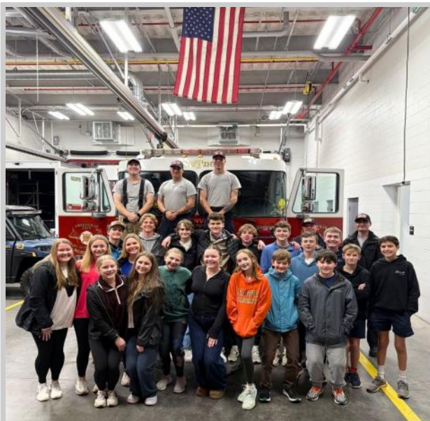
Our youth had fun spreading the love last weekend by baking and delivering cookies to firefighters at Station 3 (who gave us an awesome tour!)